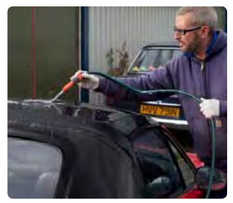
Rinse down Once the whole hood had been worked over, the cleaner was hosed off and it was left to air dry. Again, it's not a bad idea to release the hood to allow the air to circulate right down into the deepest recesses.