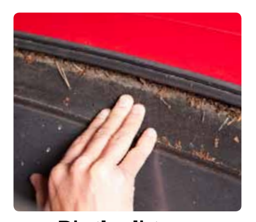
Dig the dirt This is the reason we wanted the window down and out of the way the gutters that run all the way around the base of the hood catch tons of debris. We'll need to remove this before the hood gets wet.