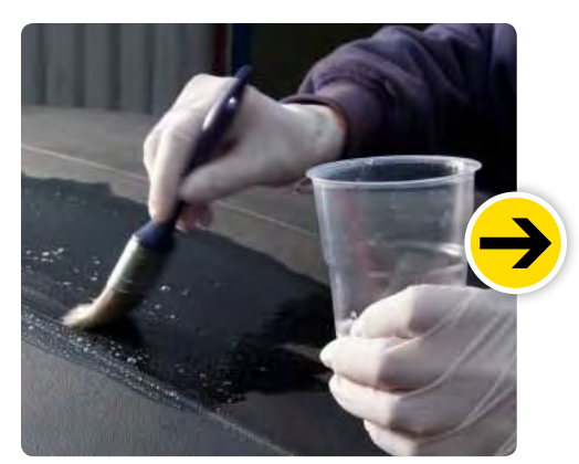
Deep clean The soft top cleaner is brushed on to the vinyl and left for a few minutes to work its magic. Apply an even coat and make sure you get down into those recesses of the hood you've just cleaned out.