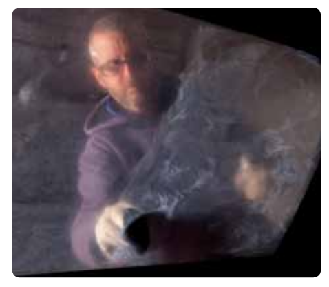
On the grid If you work a section of the window at a time on both sides, you can see how many bits you've missed. Apply in a rotary motion, and keep dabbing on more polish. As you rub, you'll feel the cloth start to drag.