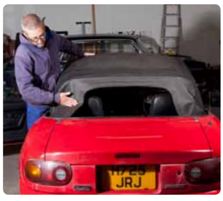
In the fold We're not ready to fold the hood down yet, but gently lift it away from the windscreen header rail to loosen the fabric and allow access to the drainage areas all around the perimeter of the hood.