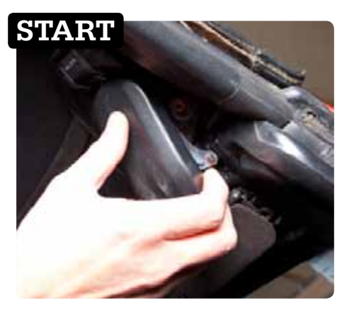
Under tension Check your owners manual for the correct way to drop the hood - this usually involves releasing the tension on the roof first. On the Mazda, you release the two clamps on the screen header rail.