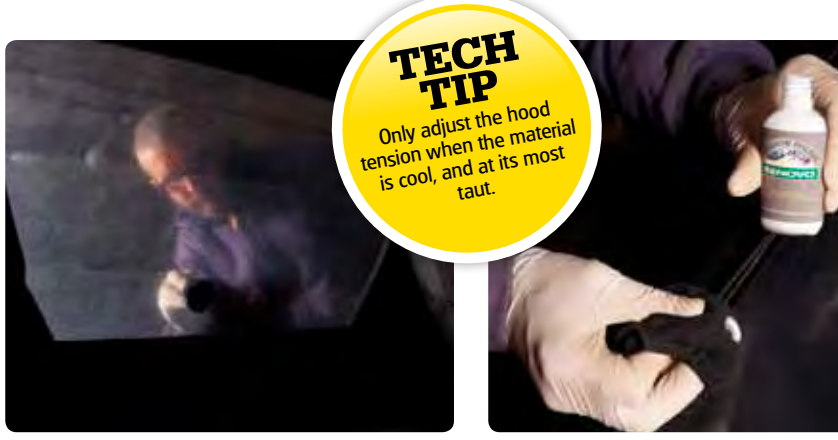
Cloudy start Time to sort out that hazy rear window. First step is too make sure that the cleaning process has removed all traces of dirt and grit - you don't want to grind that into the plastic while polishing it.