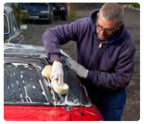
Foam up As per the instructions, we then used a sponge and warm water to work the cleaner into a foam that really lifts the dirt out of the hood. We released the hood clips to work the cleaner right down to the hood base.