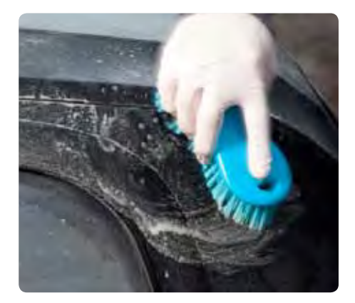
Brush off We found that the dirt was so ingrained into our hood that a soft scrubbing brush was needed to work the hood cleaner in, especially along the stitched seams. Don't be too vigorous though.