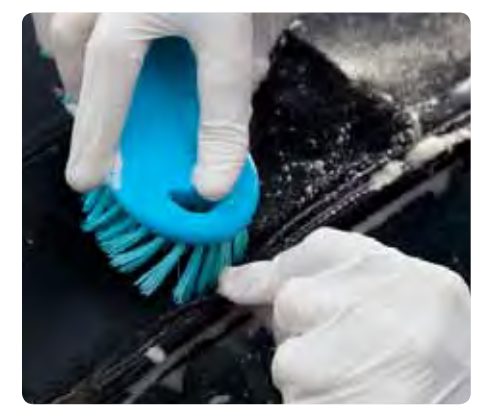
In the gutters The stitched-in gutters above the doors are also mud traps, and if left untreated, the vinyl quickly cracks - we used the scrubbing brush to work along them and clean them out.