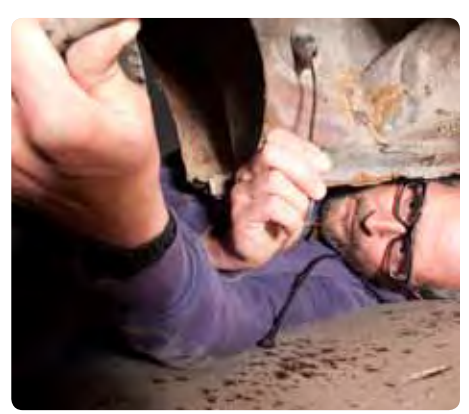
Drain works Underneath the car, locate the drain outlets and clean them out - strimmer wire is ideal for this. Blocked hood drains can lead to wet carpets, damaged trim and ultimately, body corrosion.