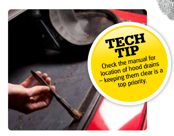
Brush up Work your way around with a soft brush and clean out all the collected debris - it's amazing how much builds up in this area, particularly if the car has been parked up outside for an extended period.